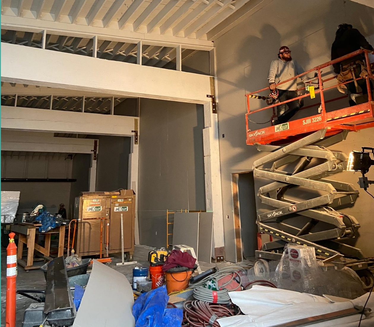
St Helen's Food Bank Interior Construction