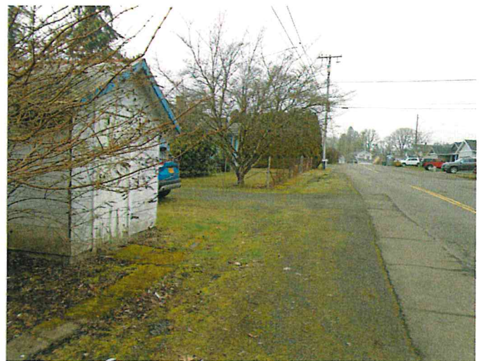
Left: 58927 Firlok Park Street single-family dwelling. Two accessory structures pictured in background. Right: Firlok Park Street right-of-way abutting subject property looking north