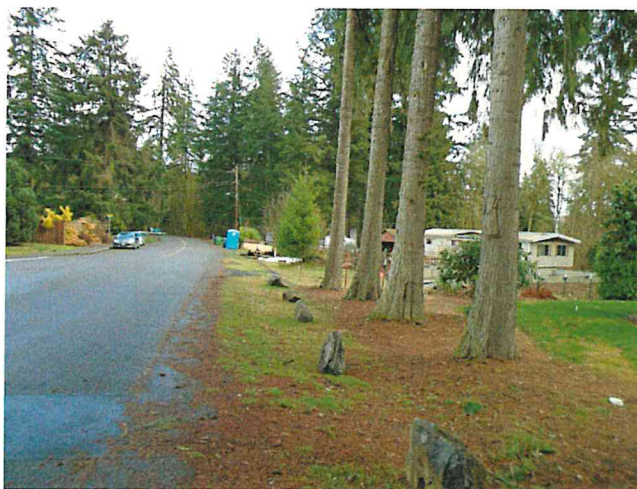
Left: 35082 Maple Street single family dwelling. Fir trees along the northern property line pictured. Right: Maple Street frontage abutting the property, looking west.