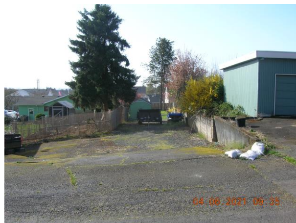
Subject property from Hillcrest Road

North – County Single-Family Residential (R-10) East – City Moderate Residential (R7) South – City General Residential (R5) West – County Single-Family Residential (R-10)