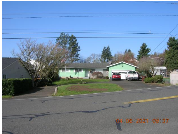
Subject property from North Vernonia Road

The subject property is a 15,246 square foot (0.35 acre) flag lot developed with a detached single-family dwelling. The property abuts N. Vernonia Road with a circular paved driveway approach. The pole portion of the lot accesses Hillcrest Road, but it is not paved and has a detached accessory structure. Although both roads are developed, there are no frontage improvements on either road abutting the property. Vernonia Road, classified as a Collector Road within the City's jurisdiction, has frontage improvements on the opposite side of the property, but none abutting the property. Hillcrest Road is within the County's jurisdiction. The property is currently served by City water, but it is on a private septic system. There is existing access to connect to the City's sanitary sewer system without extending the mainline.