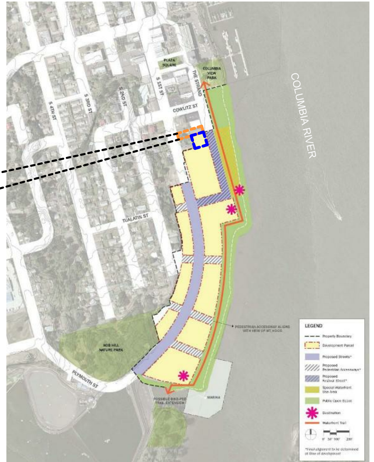
IMAGE FROM USEPA AREA-WIDE PLANNING PROJECT RESOLUTION 1765