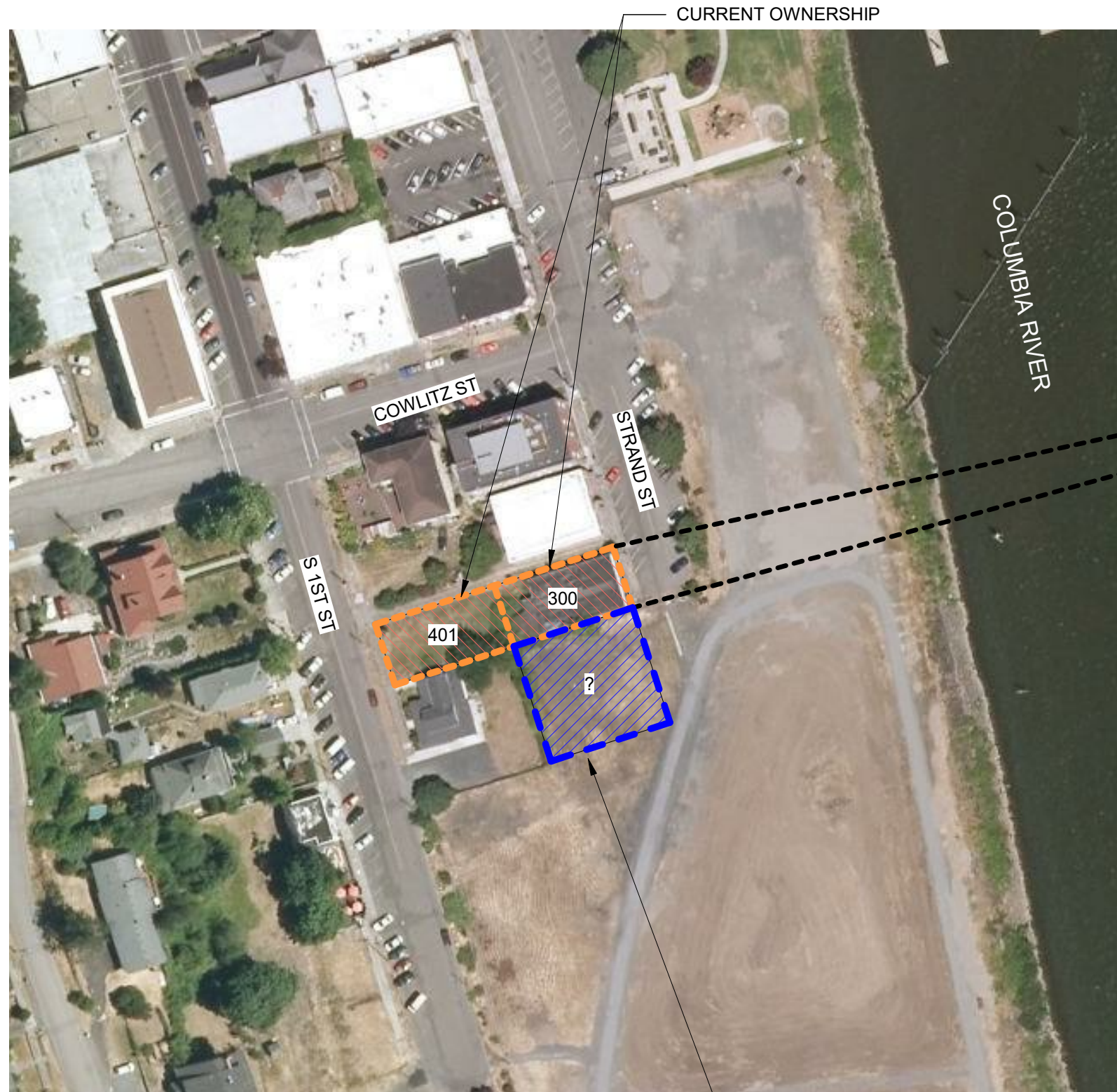
LOT IN QUESTION