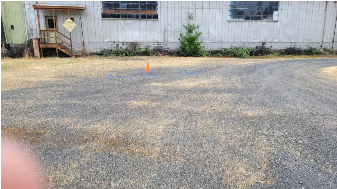
Wide angle view of AWI underground water leak. No visible signs of water at surface level.