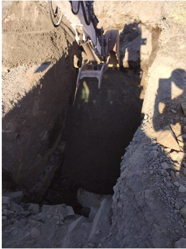
Contractor excavating down to the water line on 8/1/23