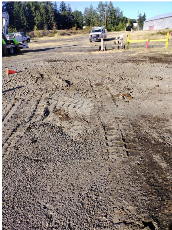
Repair complete on 8/1/23. Excavation area filled and graded.