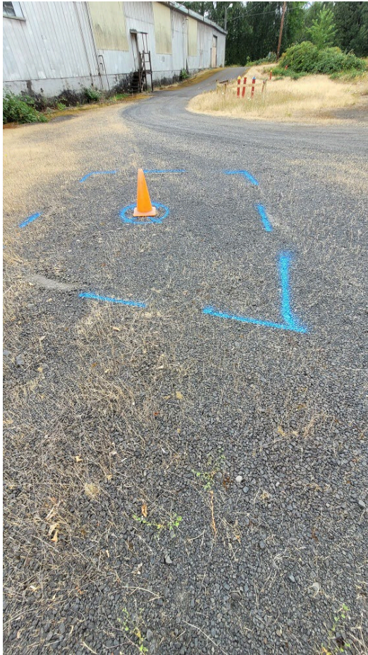
Location of AWI underground water leak. No visible signs of water at surface level.