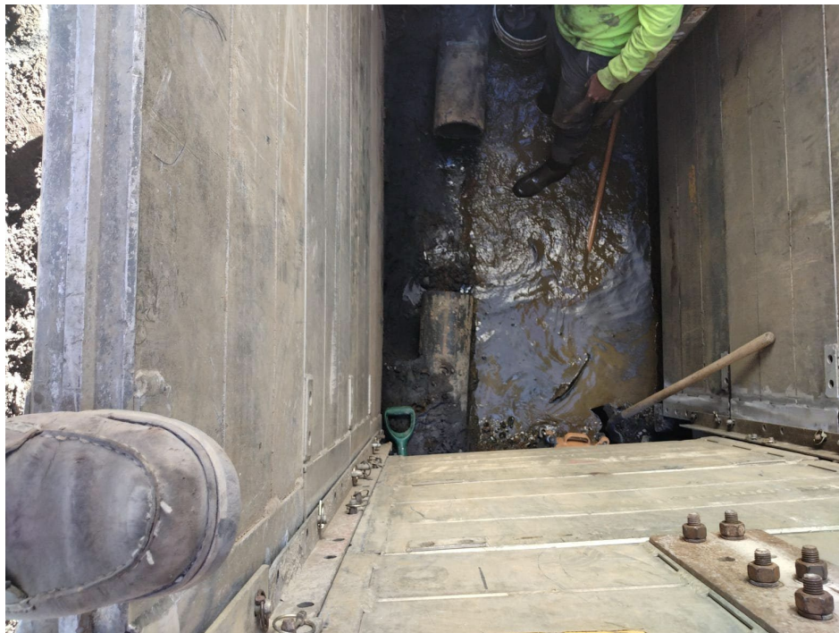
Contractor replacing 4 ft section of 8 in underground pipe, approx. 10 ft down. Coffers walls installed and continuous air monitoring conducted to ensure worker safety during the repair.