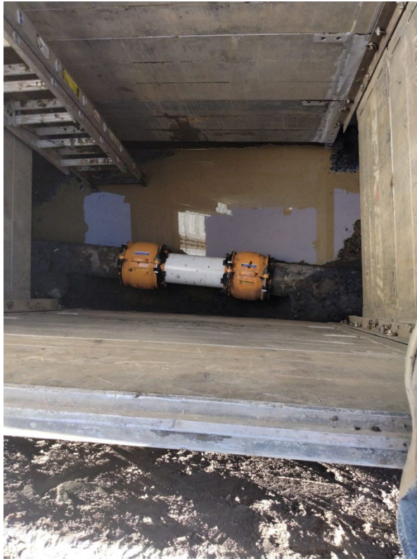
New 4 ft section of pipe installed to repair leak on 8/1/23. Line tested. No leaks.