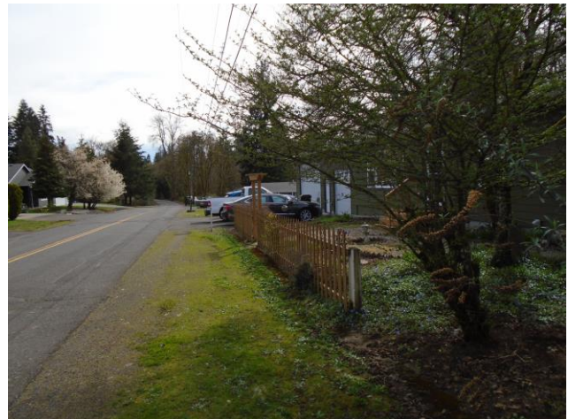
Left: 58909 Firlok Park Street single-family dwelling Right: Firlok Park Street right-of-way abutting subject property looking south