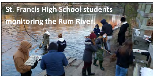
St. Francis High School students monitoring the Rum River