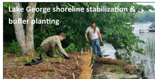
Lake George shoreline stabilization & buffer planting