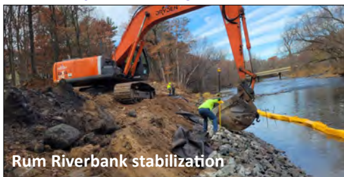
Rum Riverbank stabilization