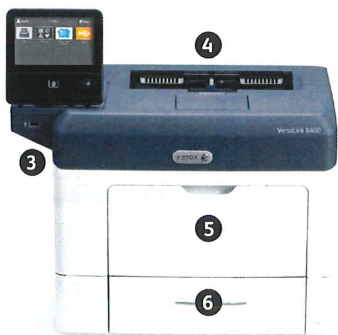
Xerox® VersaLink® B400 Printer Print.