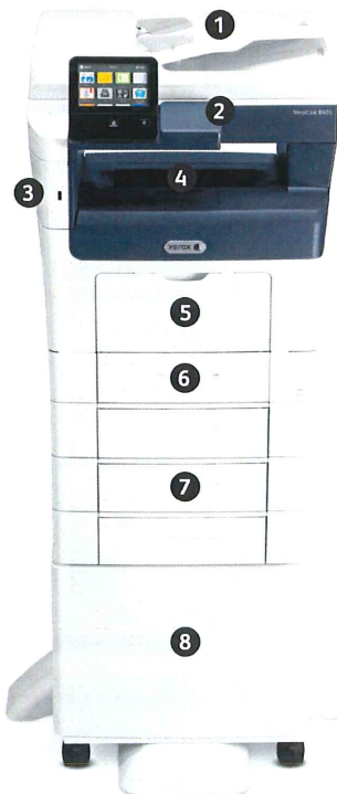
Xerox® VersaLink® B405 Multifunction Printer Print. Copy. Scan. Fax. Email.