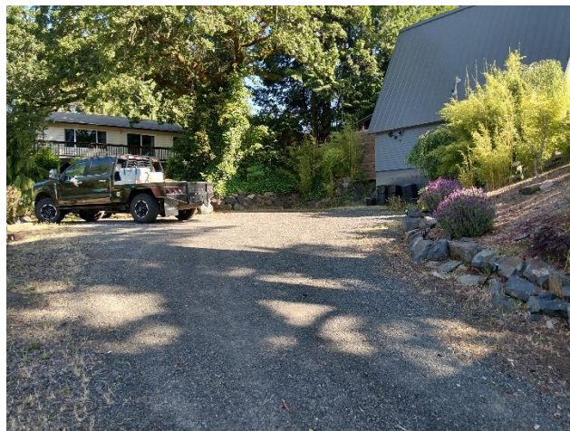
Image 1. Current onsite parking area