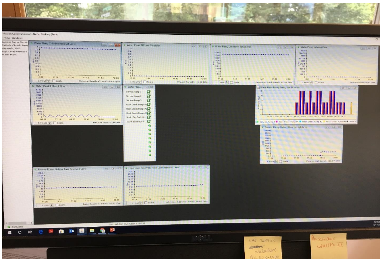
Remote Terminal Unit & Real time view screen