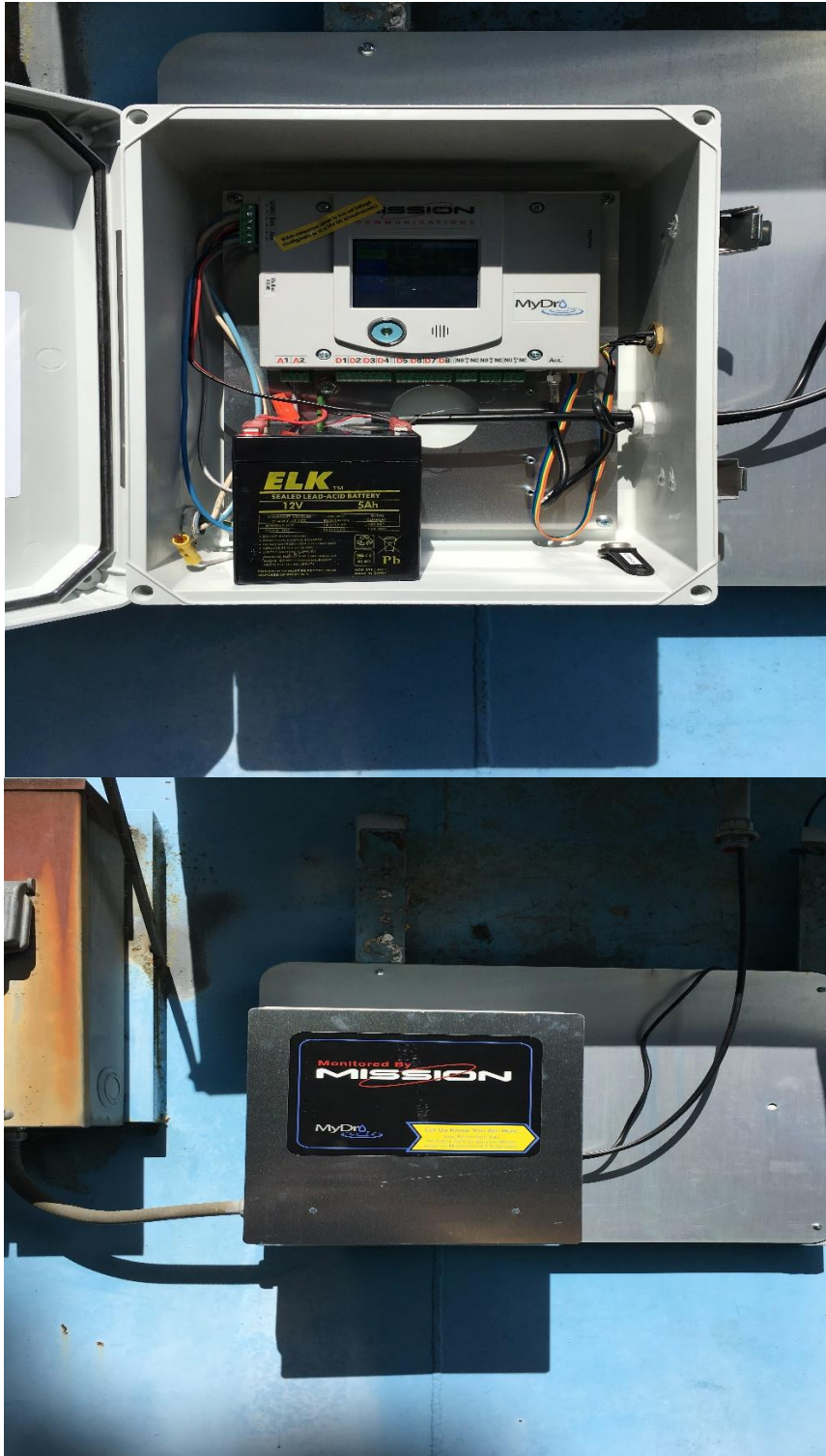
New Mission Communication with Battery Backup