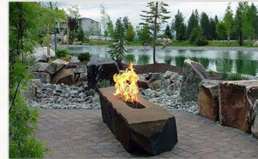
BASALT FIRE PIT