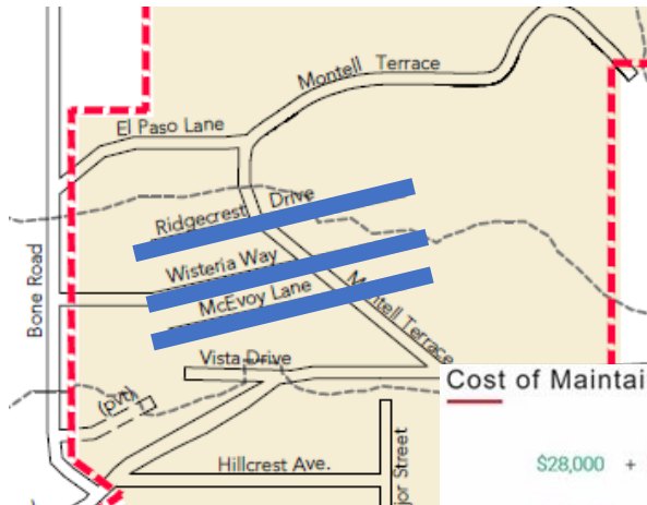
Cost of Maintaining 1 Mile

This chip seal project conditions and extends the life of the pavement on Ridgecrest Drive, Wisteria Way and McEvoy Lane. Maintaining the road is less costly than waiting until the road needs complete reconstruction.