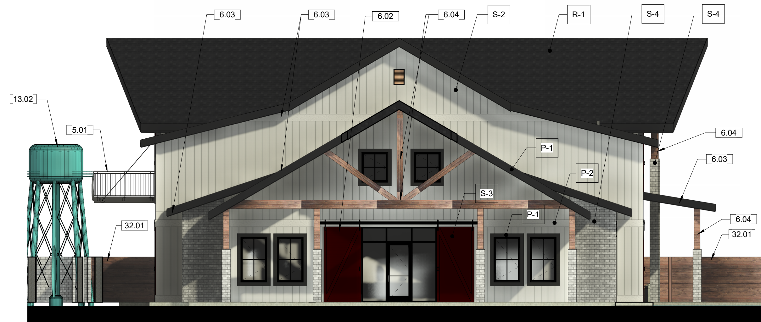
3 S ELEV B 1/8" = 1'-0"