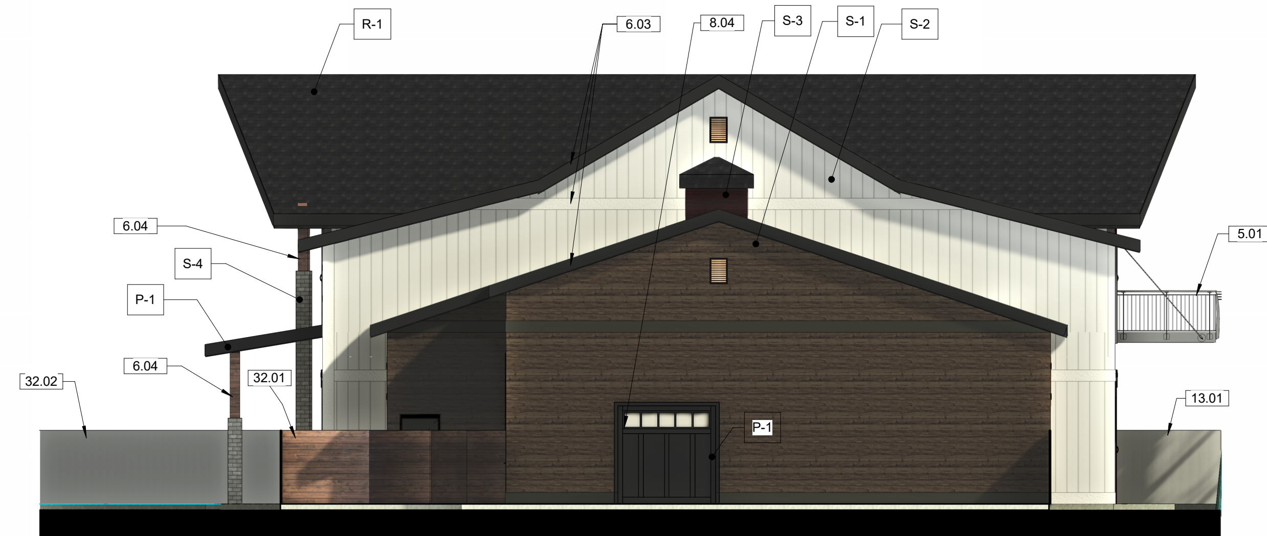
2 N ELEV B 1/8" = 1'-0"