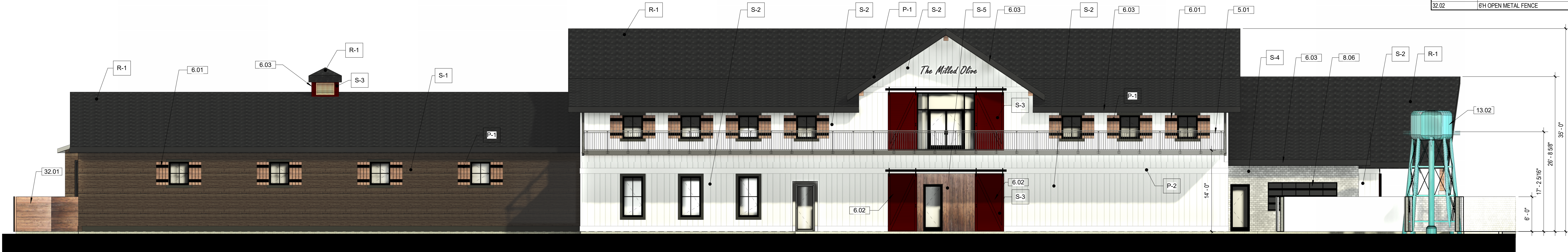
4 MAIN ELEV B 1/8" = 1'-0"