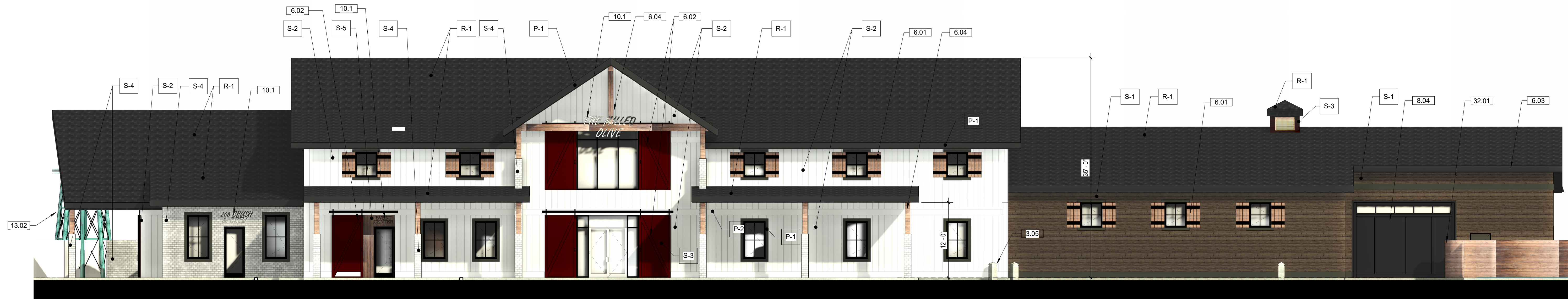
1 STAR RD ELEV B 1/8" = 1'-0"