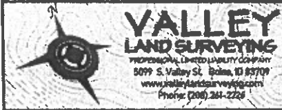
EXHIBIT DRAWING FOR CITY OF STAR ANNEXATION A PORTION OF GOVERNMENT LOT 4 IN SECTION 6, TOWNSHIP 4 NORTH, RANGE 1 WEST, BOISE MERIDIAN LOCATED IN THE COUNTY OF ADA, STATE OF IDAHO