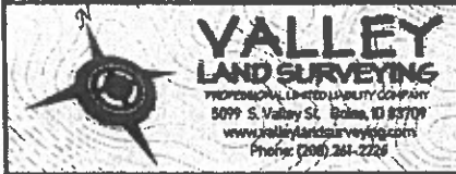
EXHIBIT DRAWING FOR CITY OF STAR ANNEXATION A PORTION OF GOVERNMENT LOT 4 IN SECTION 6, TOWNSHIP 4 NORTH, RANGE 1 WEST, BOISE MERIDIAN LOCATED IN THE COUNTY OF ADA, STATE OF IDAHO