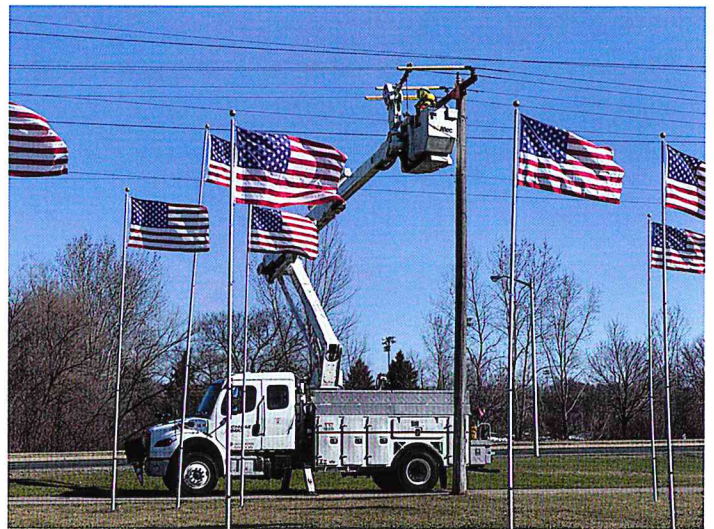
Saluting the red, white, and blue.