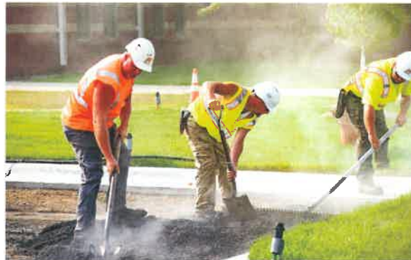
LIUNA members working on the LTC Expansion project again delivered on a great Union Built Project. The 37,000 square foot expansion will give the training center the flexibility and space to meet the training needs of the future.