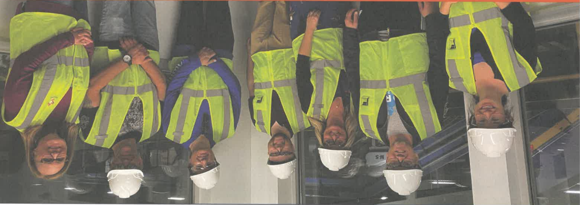
Fridley Community Connection