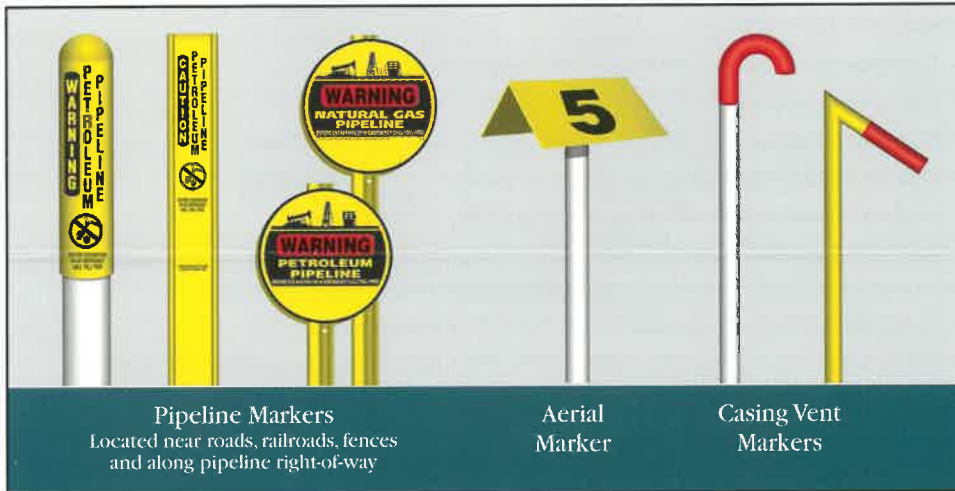
Pipeline Markers Located near roads, railroads, fences and along pipeline right-of-way

Pipeline operators have developed supplemental hazard and assessment programs known as Integrity Management Programs. Integrity Management Programs have been implemented for areas designated as “high consequence areas” in accordance with federal regulations. Specific information about an operator’s program may be found on their company website, or by contacting them directly. State and federally regulated pipeline operators maintain Damage Prevention Programs. The purpose of these programs is to prevent damage to pipelines and facilities from excavation activities.