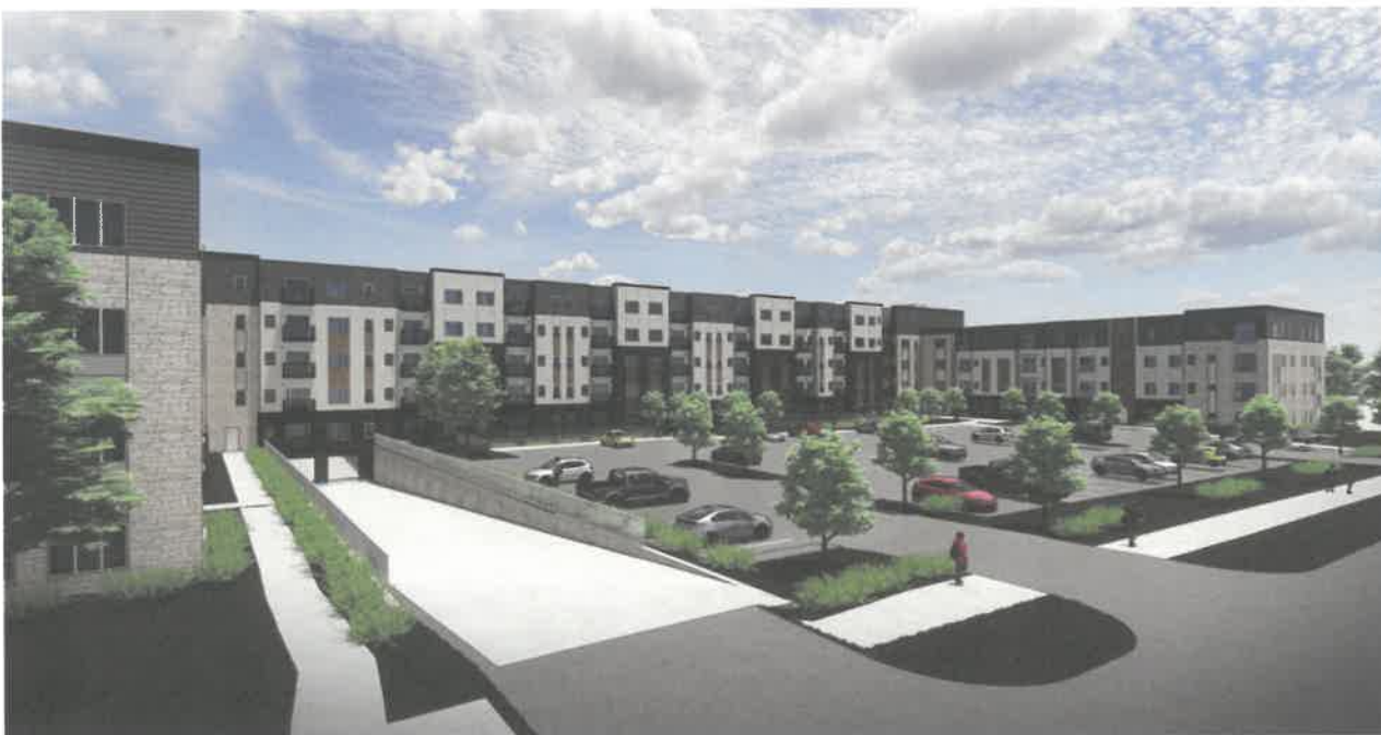
ILLUSTRATION CREDIT: KAAS WILSON ARCHITECTS

Construction of this complex is anticipated to begin fall 2023.