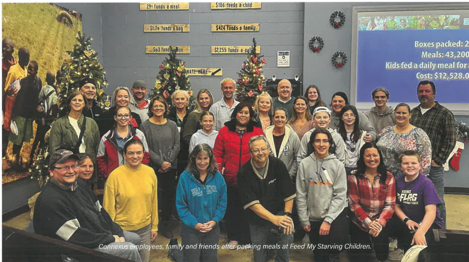
Connexus employees, family and friends after packing meals at Feed My Starving Children.