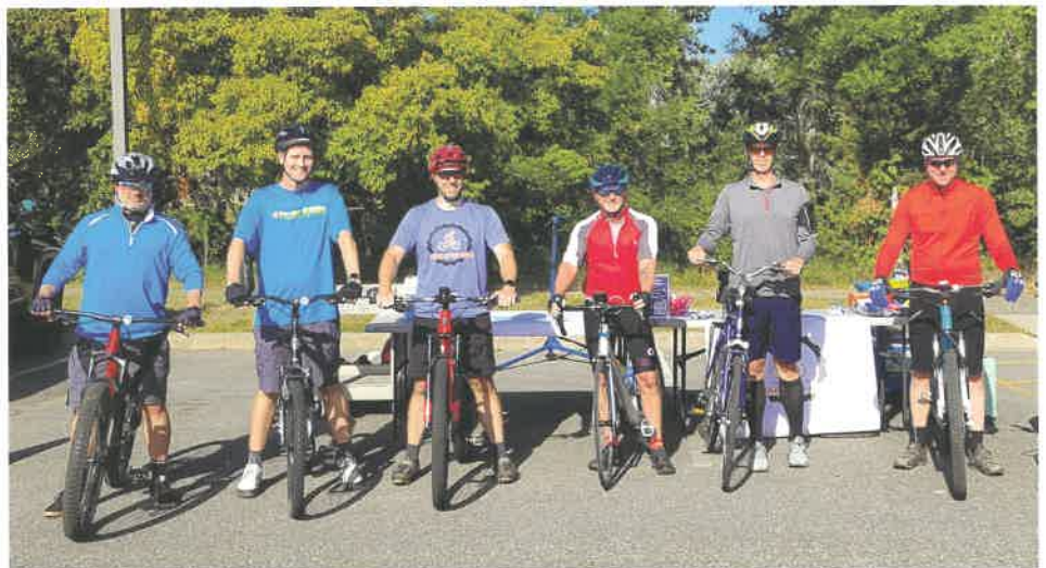
Connexus employees and their families enjoyed their 10- and 16-mile bike rides along the Mississippi River at our annual Bike into Fall event. Anoka County Commute Solutions was onsite and provided bike trail maps and backpacks with cool bike accessories.