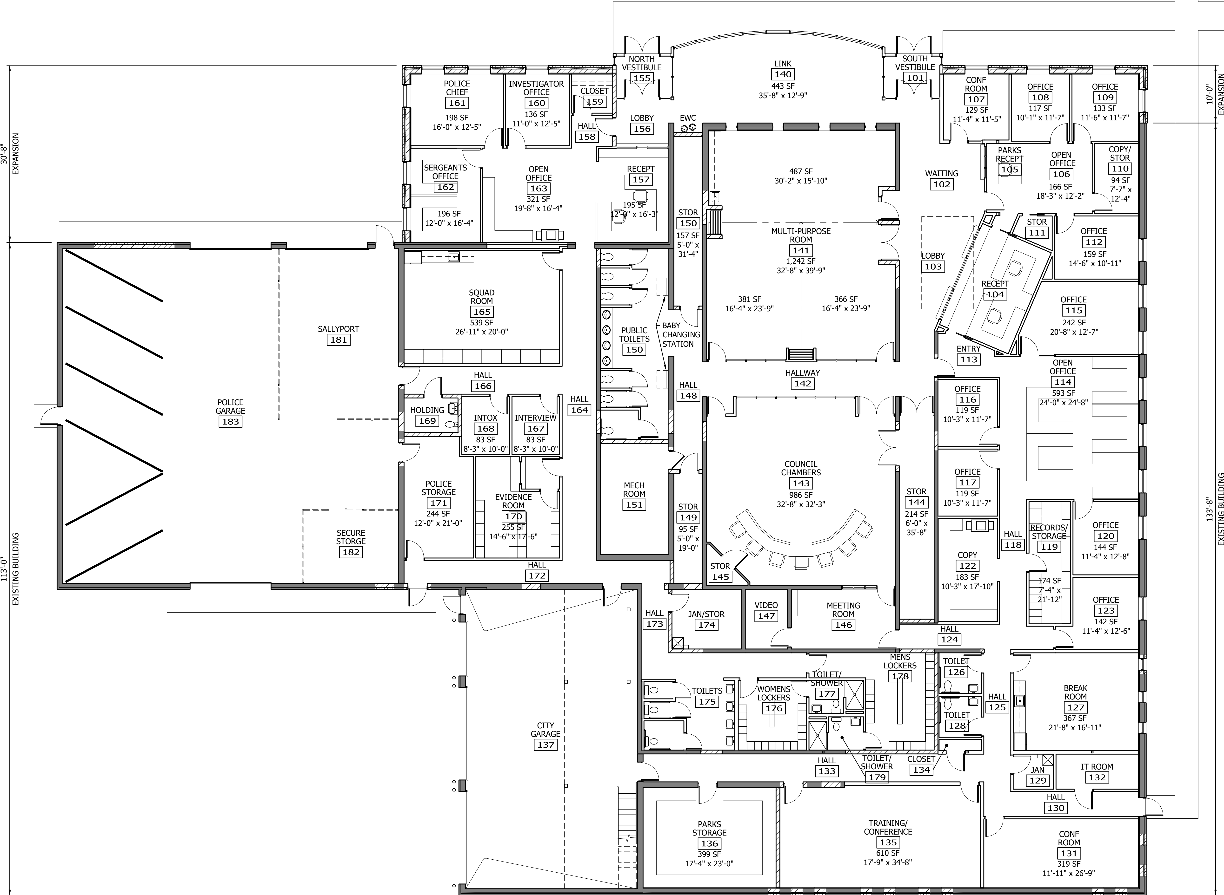
1 PROPOSED RENOVATED/EXPANDED FLOOR PLAN