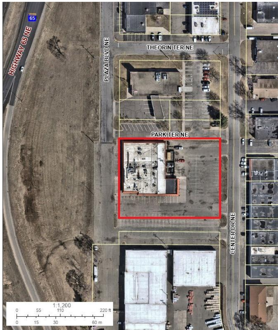
Figure 1: Aerial of the site, per Anoka County GIS. Parcel lines are shown in yellow. Subject property is outlined in red. Top of image is north.

Surrounding properties include a variety of commercial and industrial businesses along Center Drive NE, and primarily commercial uses along Plaza Boulevard NE.