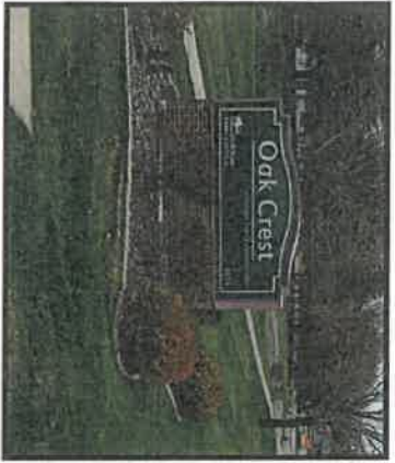
SITE VIEW - EXISTING