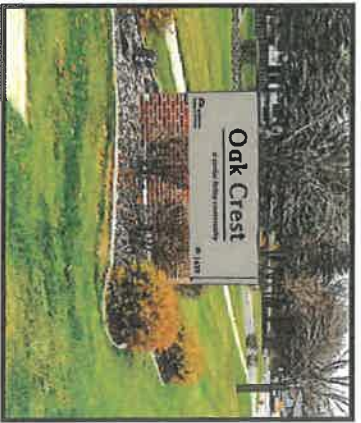
SITE VIEW - UPDATED (RENDERING)