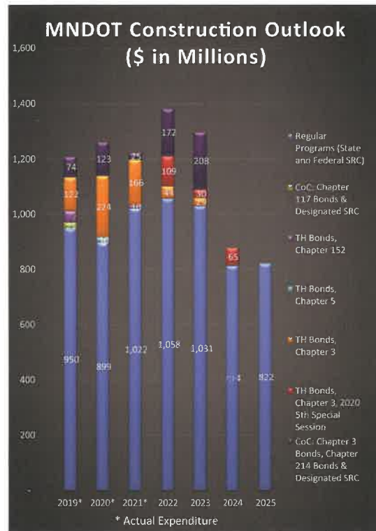
The Minnesota Department of Transportation (MNDOT) 2022 Construction Outlook for 2022 looks positive for projects and jobs building and maintaining roads and bridges.

Residential startups in single family and multifamily housing are expected to flatten, yet see small increases in 2022. Other market sectors expected to flatten are the hotel sector and the education sector.