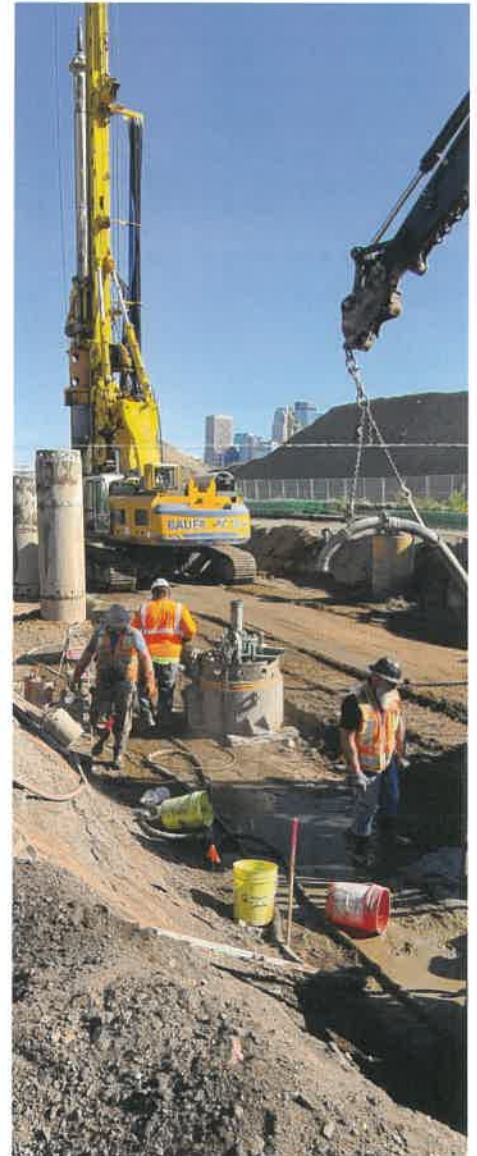
LIUNA Members and Signatory Contractors are the Infrastructure experts. SouthWest Light Rail Transit Project, 2021 - Minnesota LECET

The collaboration and cooperation from both parties on this historic legislation is both a testament to the importance of infrastructure and an encouraging sign that lawmakers and the President can work together on issues vital to the American people. LIUNA looks forward to working with the White House on the rollout of the infrastructure bill, the Build Back Better Agenda, and the creation of good union jobs building our nation.