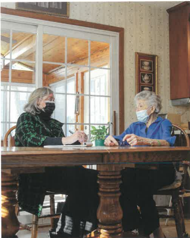
For Anoka County, reducing costs from energy usage is critical to successfully providing valuable social services including home visits for senior citizens.

Care for community is one of the seven principles guiding the work of all member-owned nonprofit cooperatives. Whether it is homeowners or farmers, nonprofits or businesses, or town, city, or county government, controlling costs while caring for community is part of Connexus’ mission.