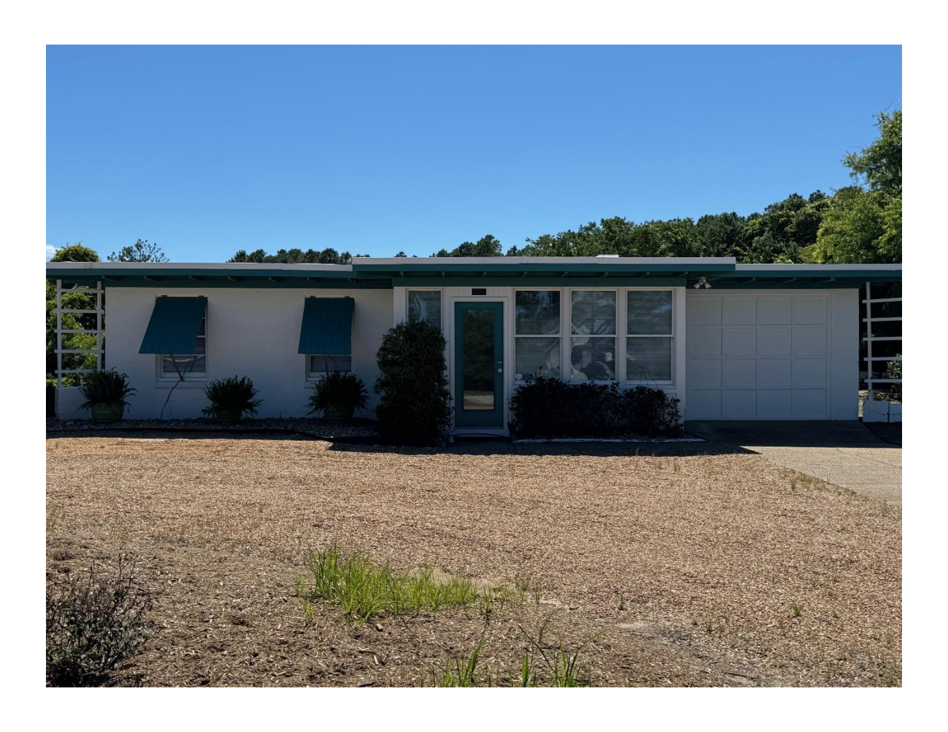
March 22, 2024 Historic Landmark Designation Report