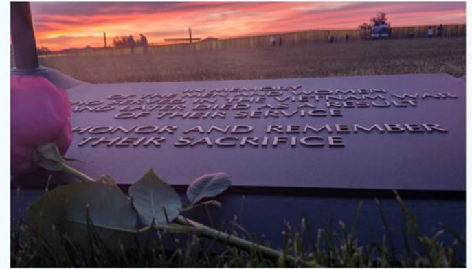
Images of the Wall That Heals.