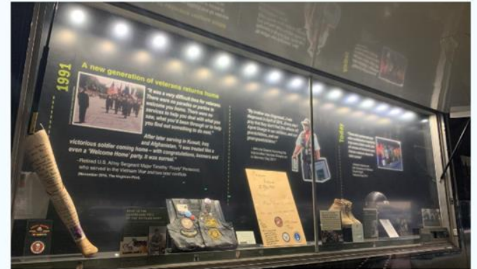
Images of the Education Center.