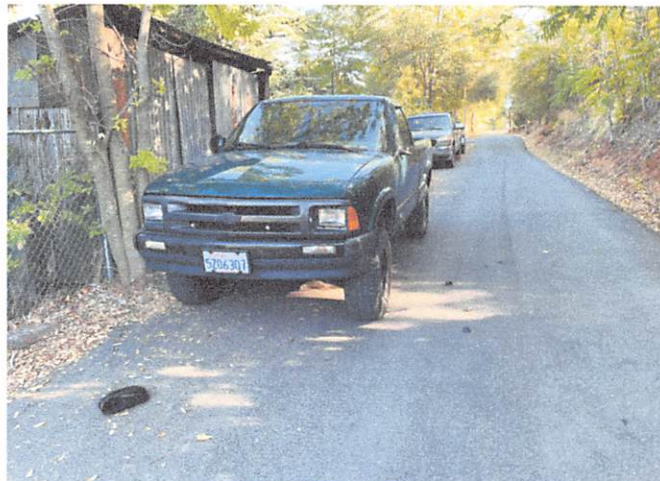
Truck side mirror broken by vehicle trying to pass it.