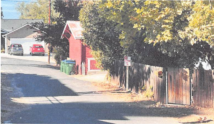
No Parking sign on Maple St. (looking North).