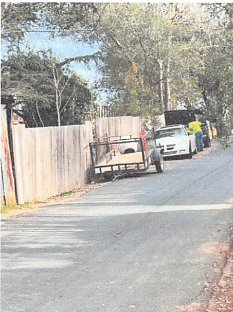
Long term non-op vehicle/equipment storage (looking South)