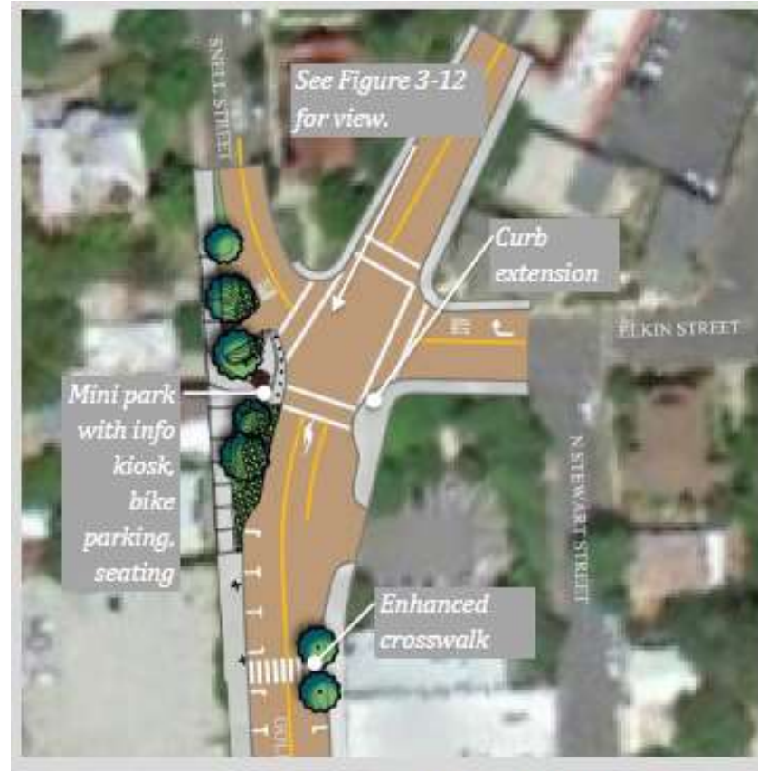
Figure 3-24. Snell/Washington Intersection