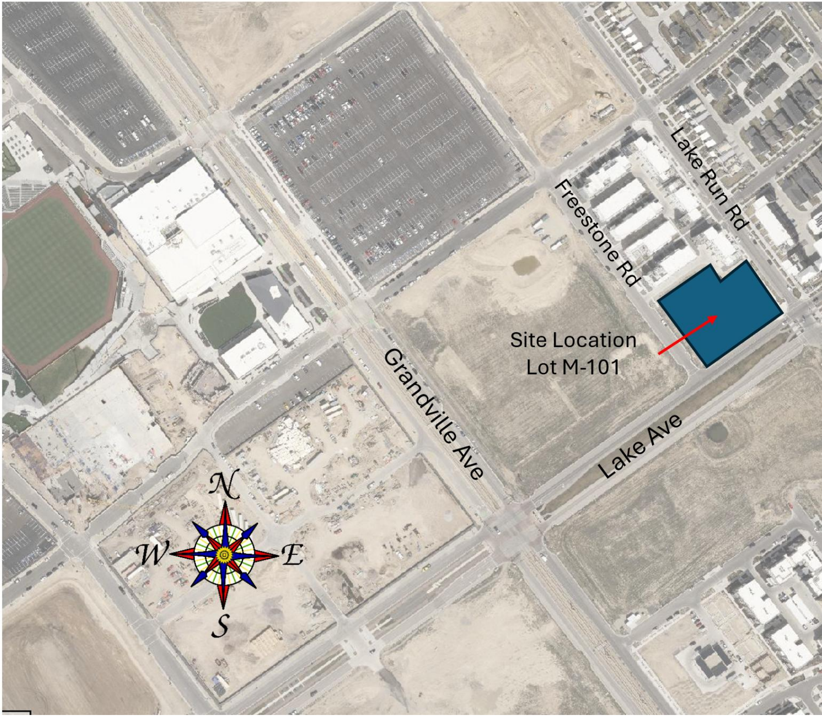
The image is an aerial map showing a highlighted site location (Lot M-101) in blue near the intersection of Lake Run Road, Freestone Road, and Lake Ave. A red arrow points to the site. Surrounding areas include buildings, parking lots, open land, and a decorative compass rose in the lower-left corner.