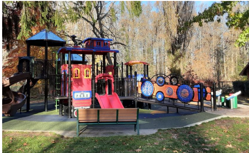
Riverview Park playground

To enrich the quality of life in the community of Snoqualmie through the stewardship and enhancement of City parks, trails, recreational facilities, open spaces, and community events.