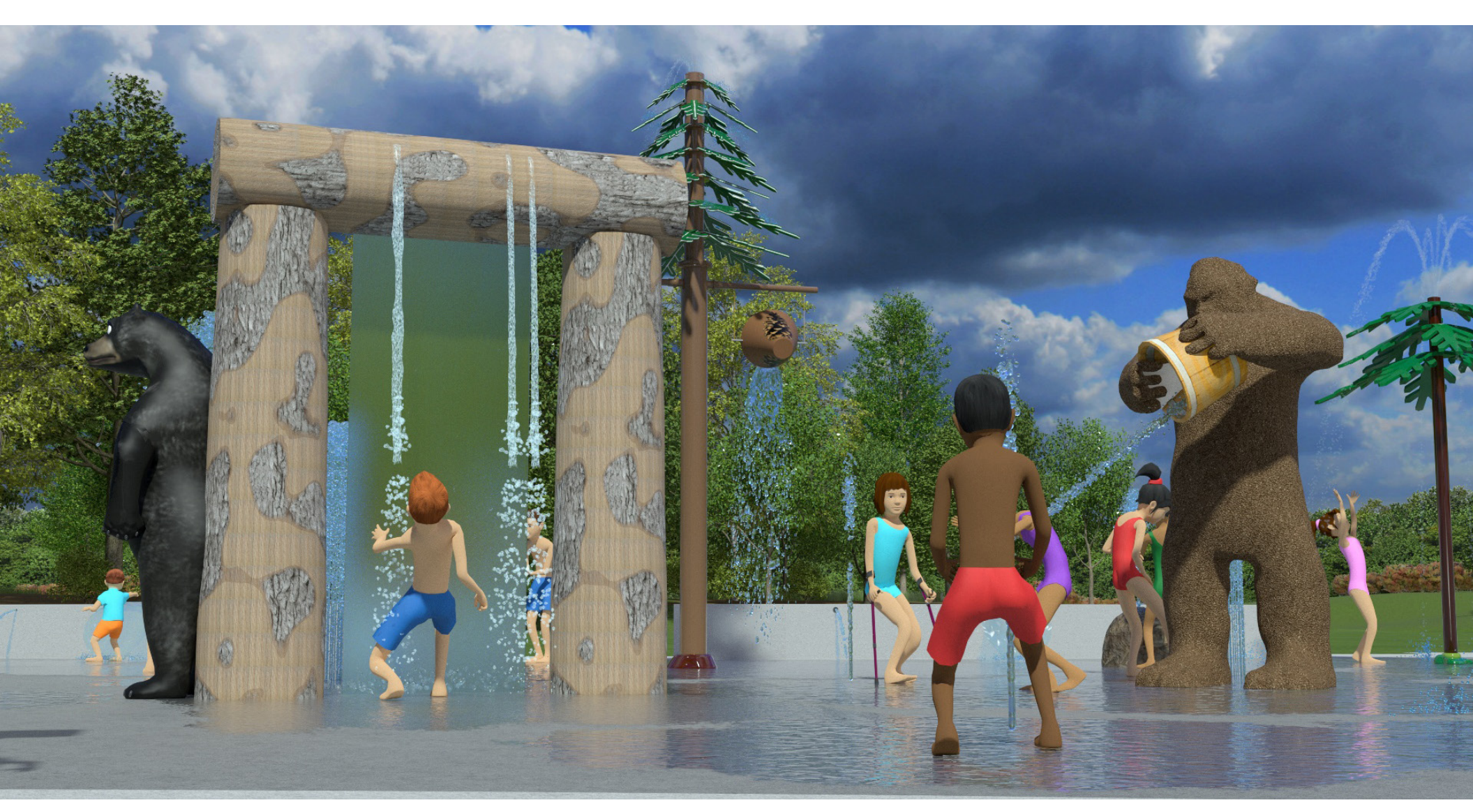
*Custom GFRC features shown on splash pad for reference. Refer to pages 12 and 13 for details.