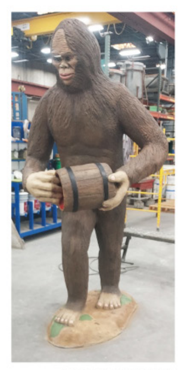
Reference pictures only

Conceptual design only and is subject to possible changes