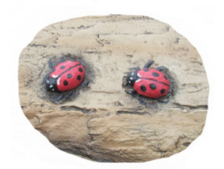
Actual LSI GFRC sculptures -Reference pictures only