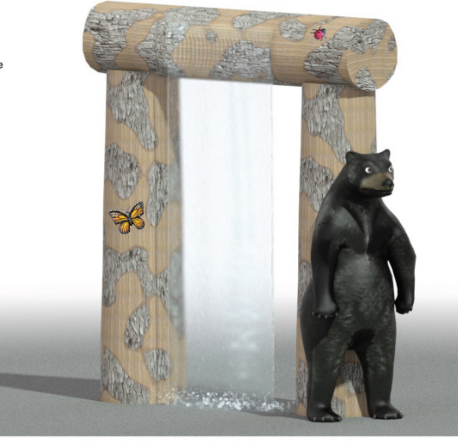
Conceptual design only and is subject to possible changes