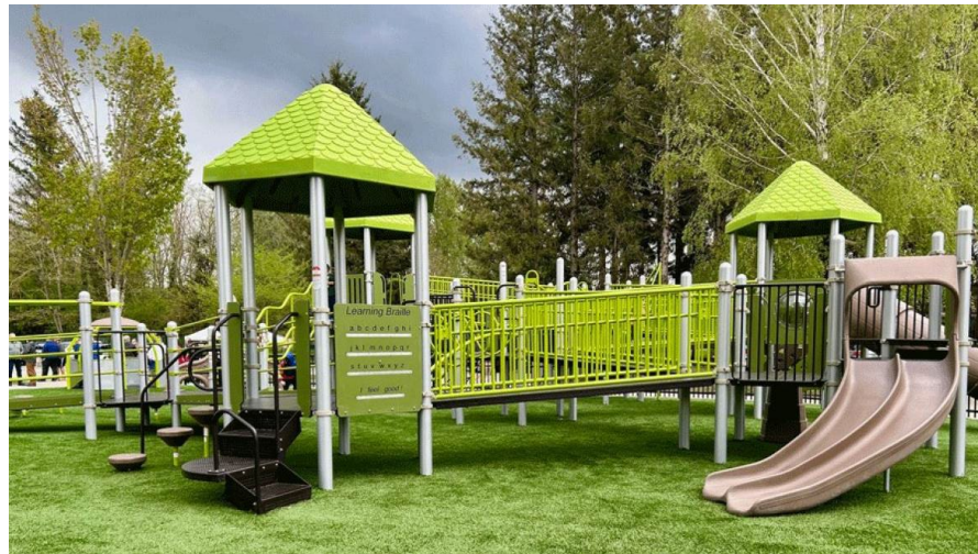
Centennial Park All-Inclusive Playground

To enrich the quality of life in the community of Snoqualmie through the stewardship and enhancement of City parks, trails, recreational facilities, open spaces, and community events.