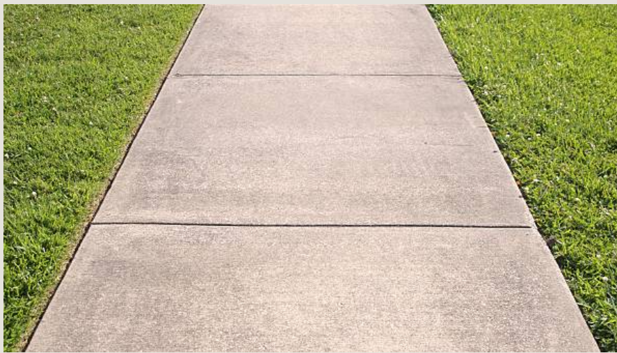
Sidewalk 6ft wide

Did you know that the City of Sandpoint has a Complete Streets Policy? This policy commits streets to be designed and operated to enable safe access for all modes of transportation. On Collector Street's, the City's Standard is to have 6ft wide sidewalk on both sides of the street.