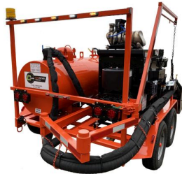
(images/products/p2 750x421/P2™ Two-Person Patcher with DuraPatcher™ Technology 3.jpg)