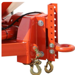
(images/products/p2 750x421/Hitch adjusts for height and distance.jpg)