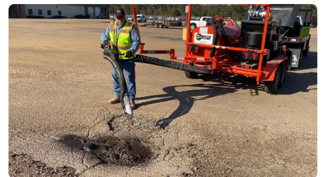
(images/products/p2 750x421/P2™ Two-Person Patcher with DuraPatcher™ Technology Ergonomic no-stress boom.jpg)