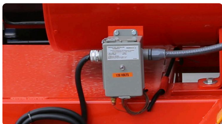
(images/products/p2 750x421/P2™ Two-Person Patcher with DuraPatcher™ Technology Overnight heating system.jpg)