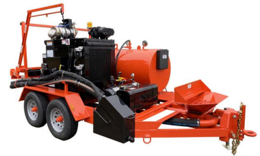
(images/products/p2 750x421/P2™ Two-Person Patcher with DuraPatcher™ Technology 4.jpg)