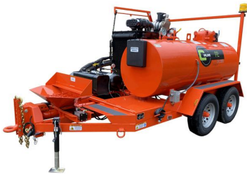
(images/products/p2 750x421/P2™ Two-Person Patcher with DuraPatcher™ Technology 1.jpg)