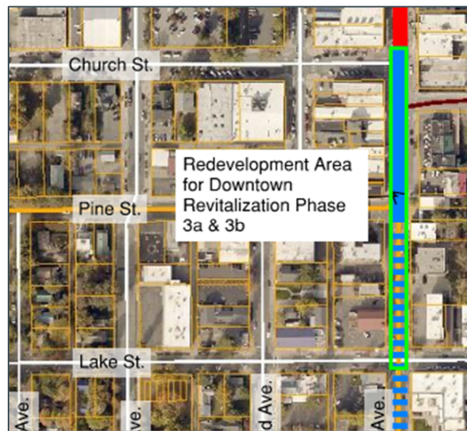
Figure 1- Redevelopment Area Site Map for Phase 3b of City of Sandpoint's Downtown Revitalization project encompasses the 1st Ave corridor from Church St to Lake Street (blue area in outlined in green).

The redevelopment area for Phase 3b City of Sandpoint's Downtown Revitalization project encompasses the 1st Ave corridor from Church St to Lake Street (Figure 1 - Redevelopment Area Site Map).