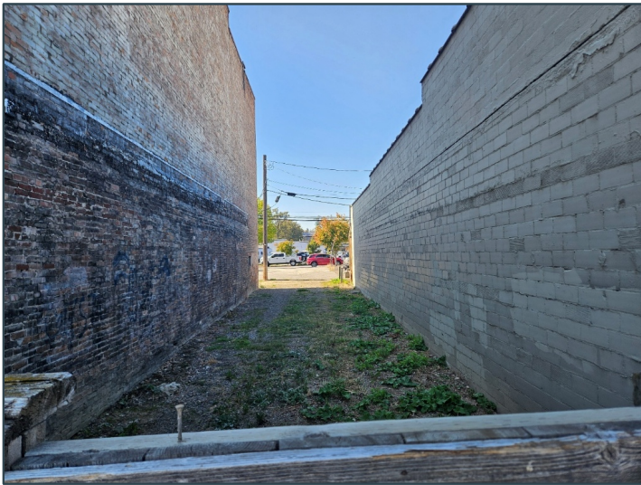
Vacant Lot Between 101-105 N 1st Ave