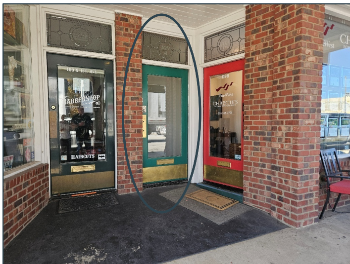
Partially Vacant - Out of Business at 109 A N 1st Ave