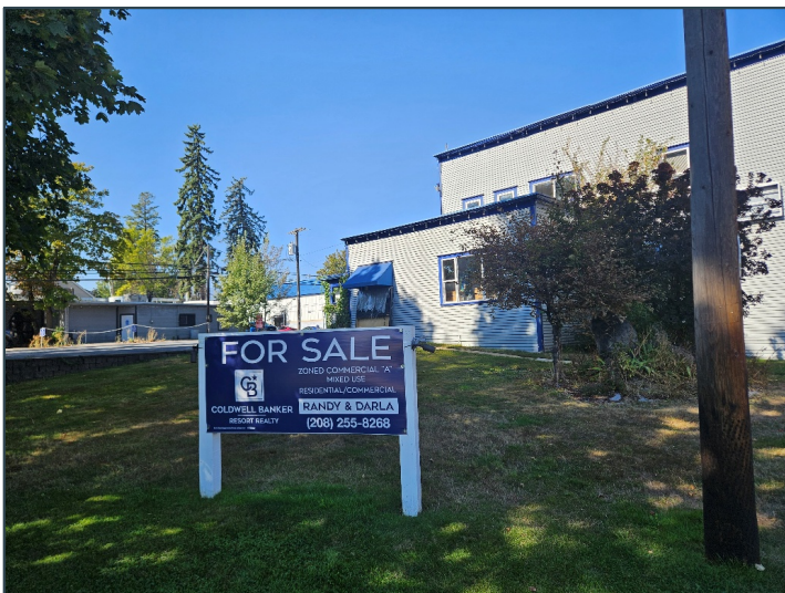
Vacant Building & Lot at 202 S 1st Ave