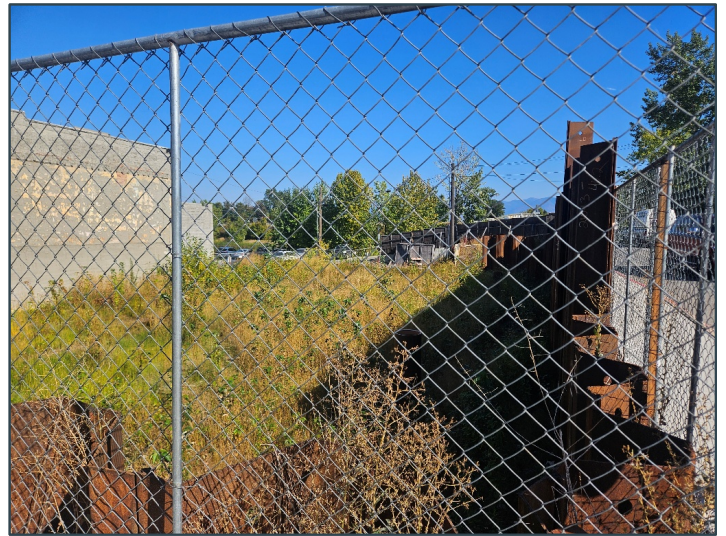
Vacant Lot "the Hole" at 206 N 1st Ave