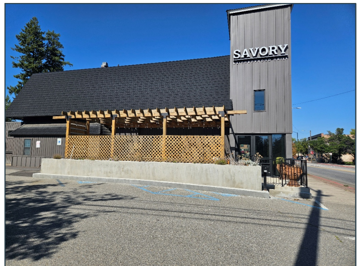
Savory Neighbor Grill- Out of Business at 120 S 1st Ave