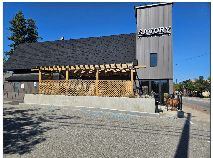
Savory Neighbor Grill- Out of Business at 120 S 1st Ave