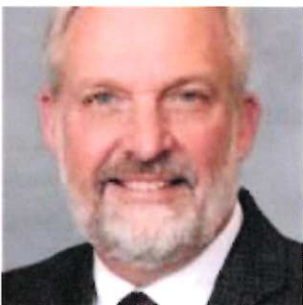
Rep. Jeff Zenger

Rep. Jeff Zenger (R-Forsyth) suggested limiting tax increases to no more than 5% a year. He said local governments must tighten their belts in the same way they're forcing taxpayers to do.