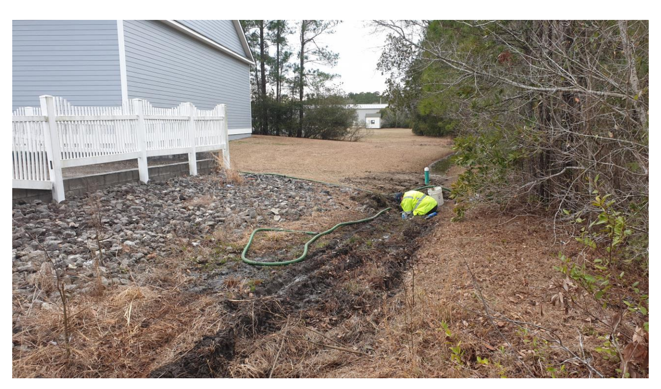
Gravity Sewer Repair