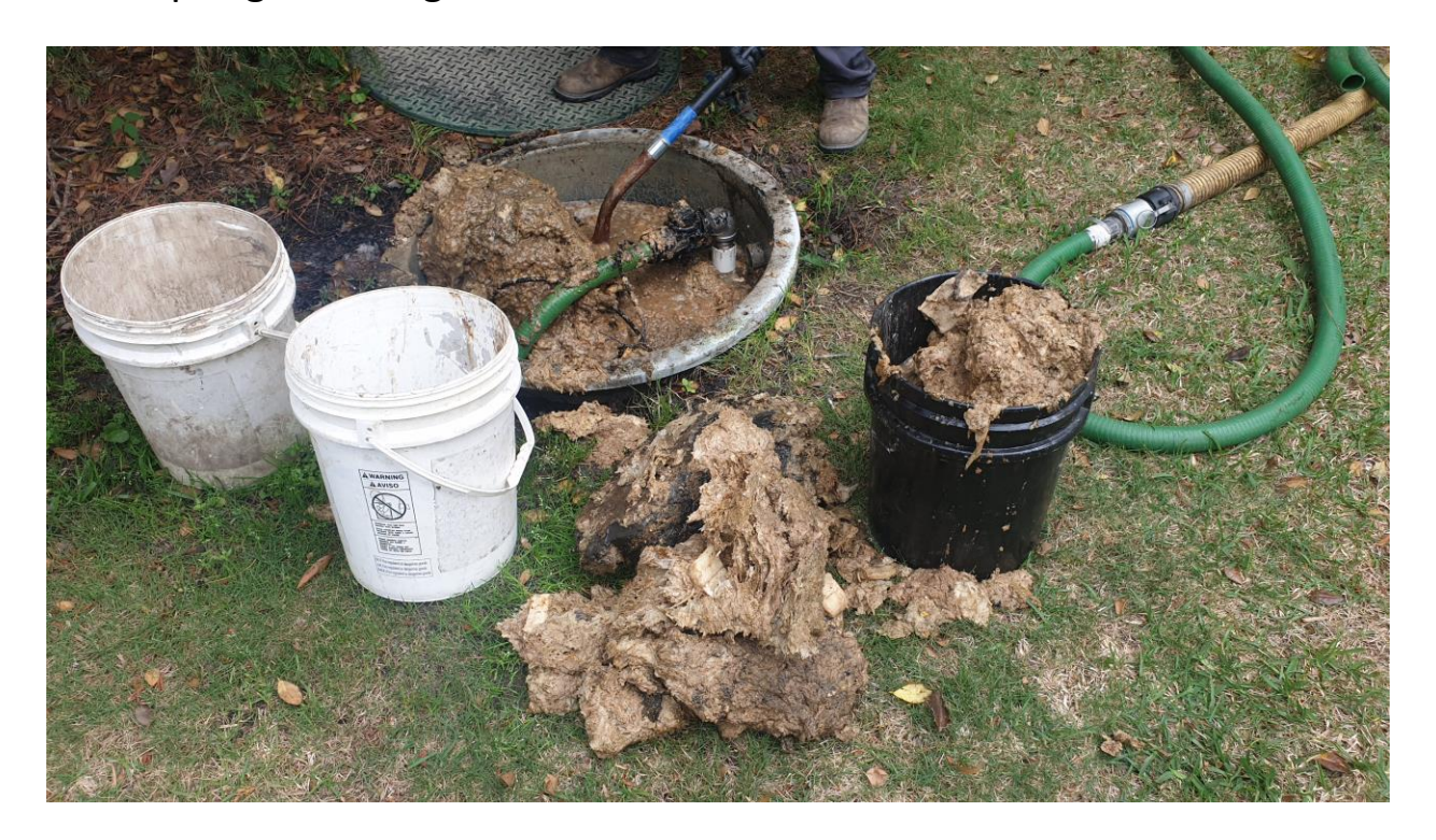
Residential Grease Removal