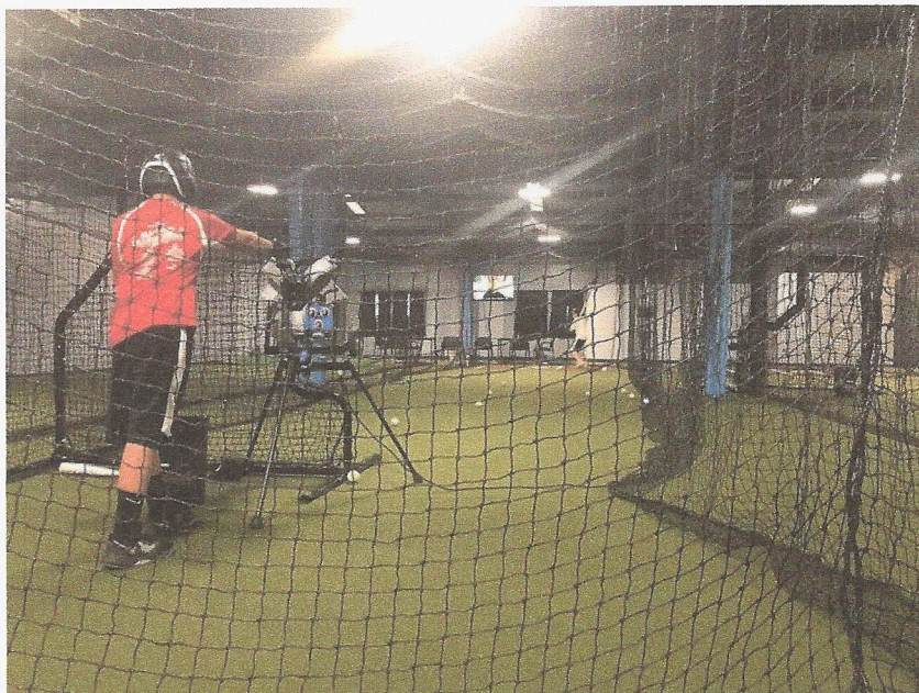
Pitching Mounds Area