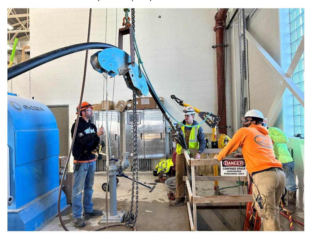
Chemical feed line pulling head positioned for pull.