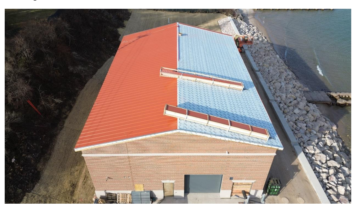
Aerial view of standing seam metal roof installation.