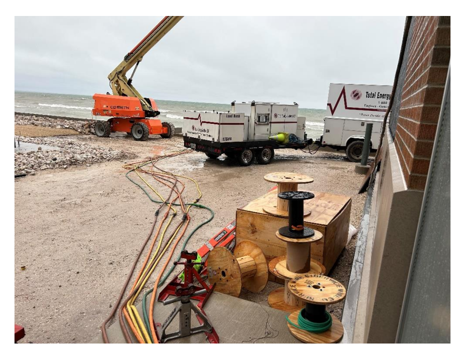
Load bank set up for generator testing.