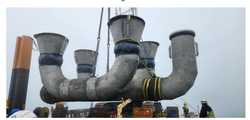
Intake structure lifted off crane barge.