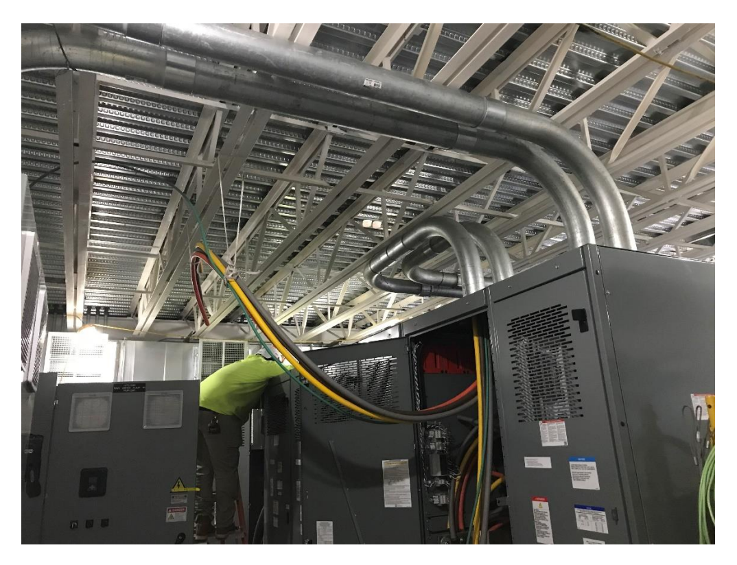
Electrical gear assembly and conduit installation.