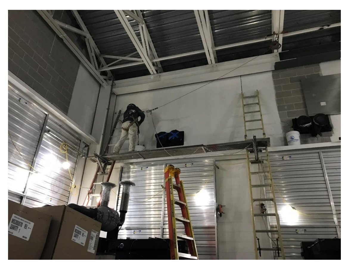
Generator room wall painting.