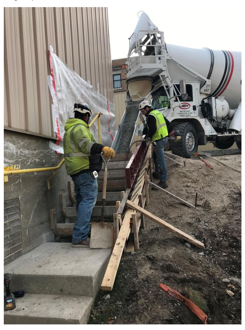
Concrete stair placement adjacent to garage.