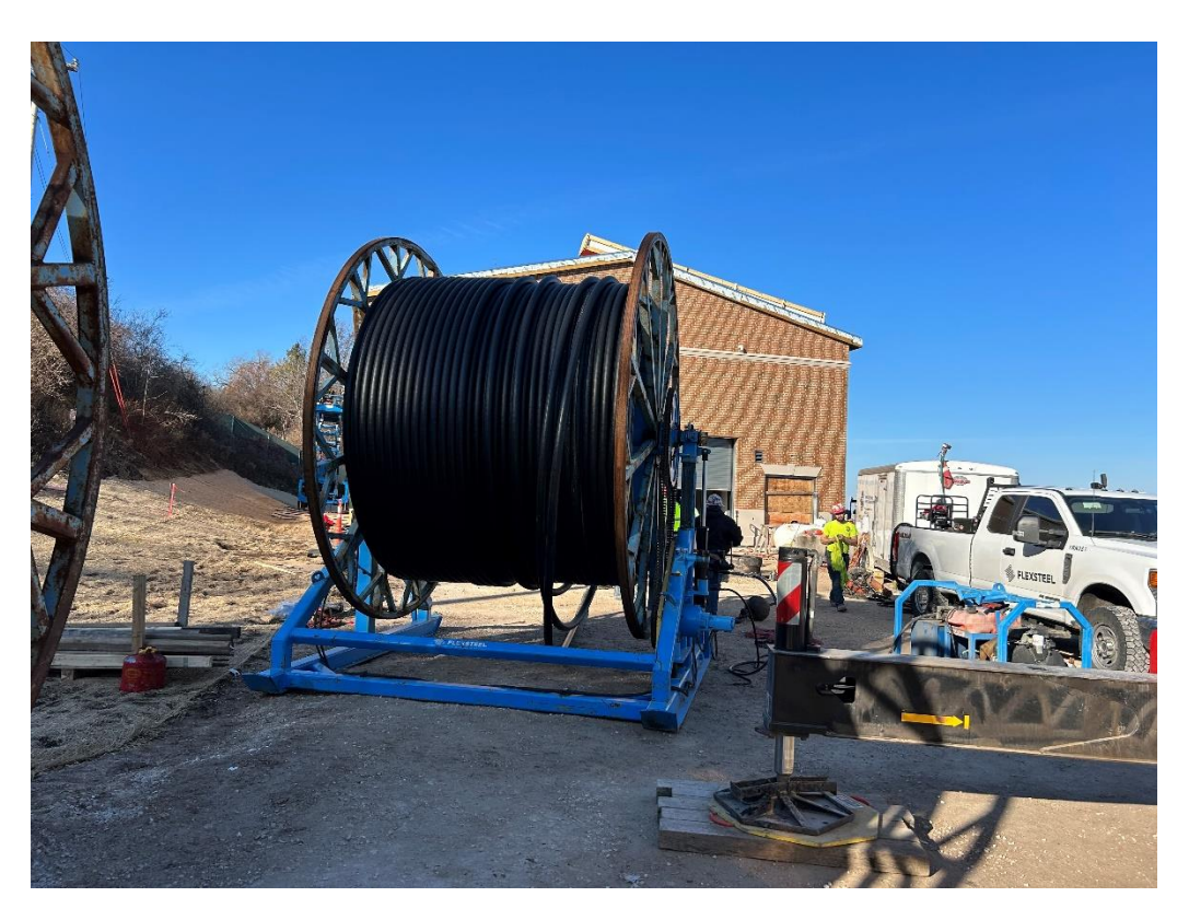
Intake chemical feed line spool set up for pull.