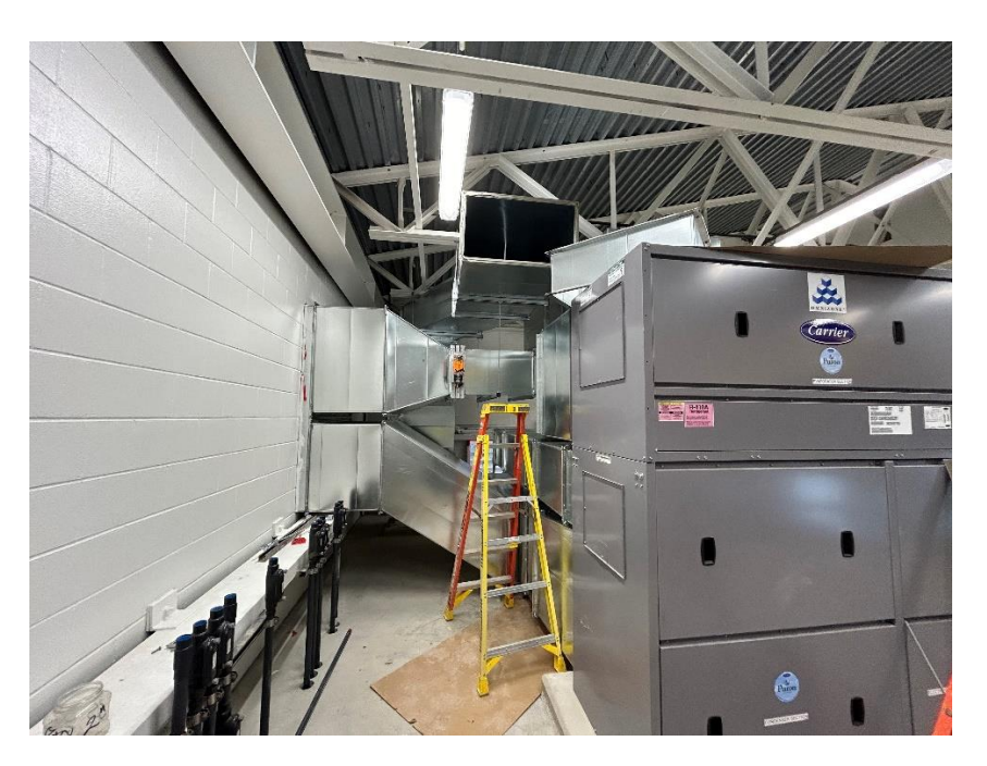
Air handling unit and ductwork at mezzanine level.