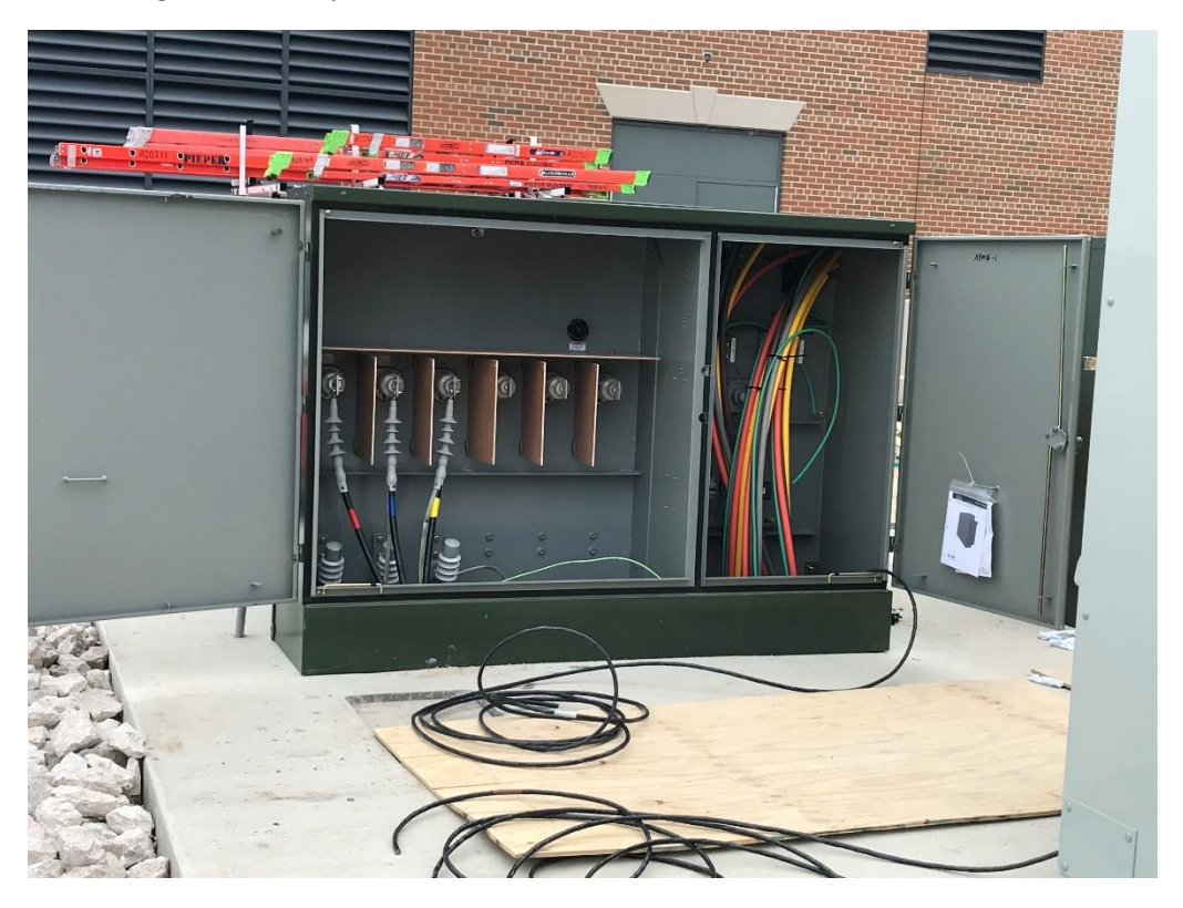
Electrical cable terminations at transformer.