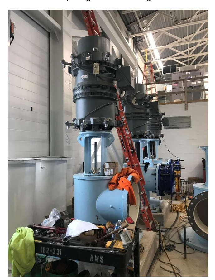
Vertical turbine pump and motor installation.