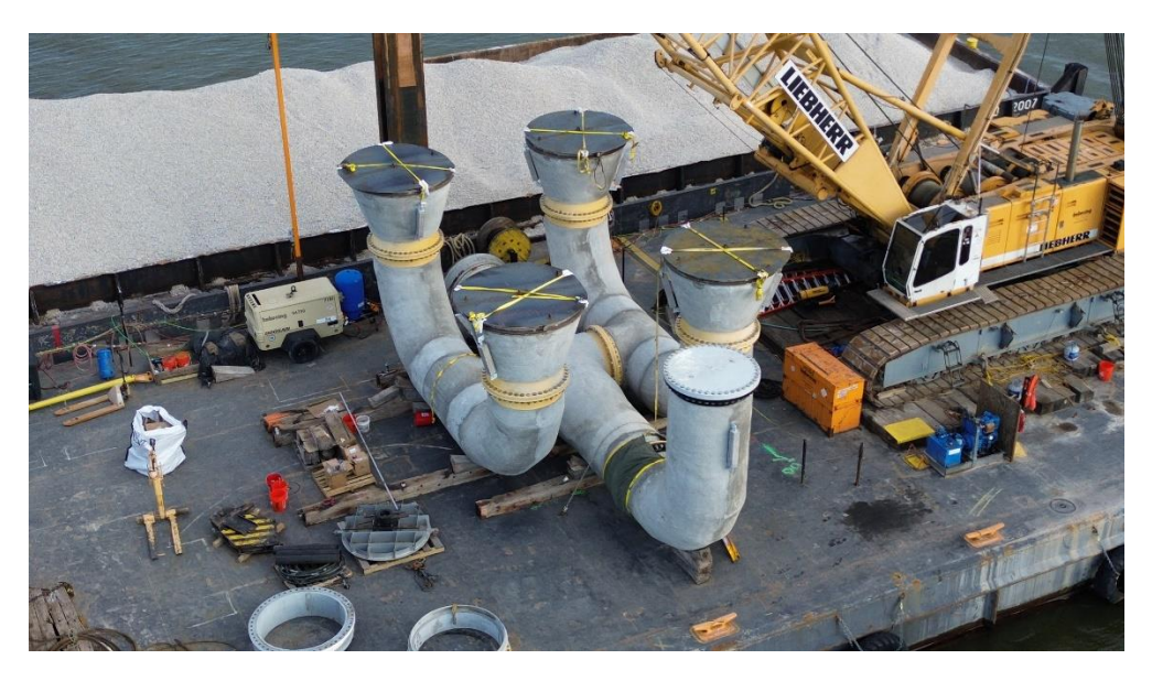
Intake structure assembled on crane barge.