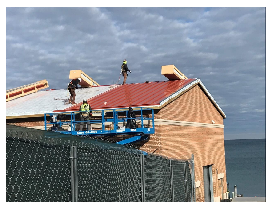
Standing seam metal roof installation activities.