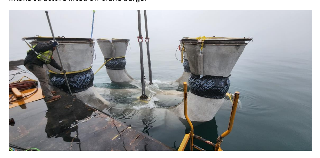
Intake structure submerged into position.