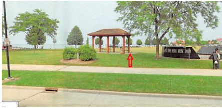
900 Broughton Drive