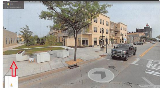
Corner of N. 8 th and Wisconsin Ave.