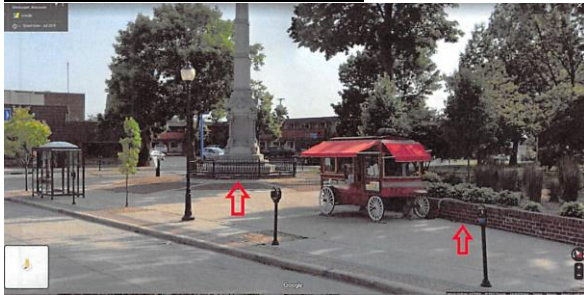
Fountain Park Monument