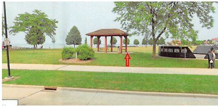
900 Broughton Drive