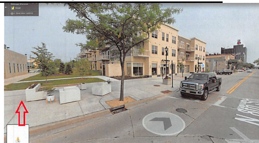
Corner of N. 8 th and Wisconsin Ave.