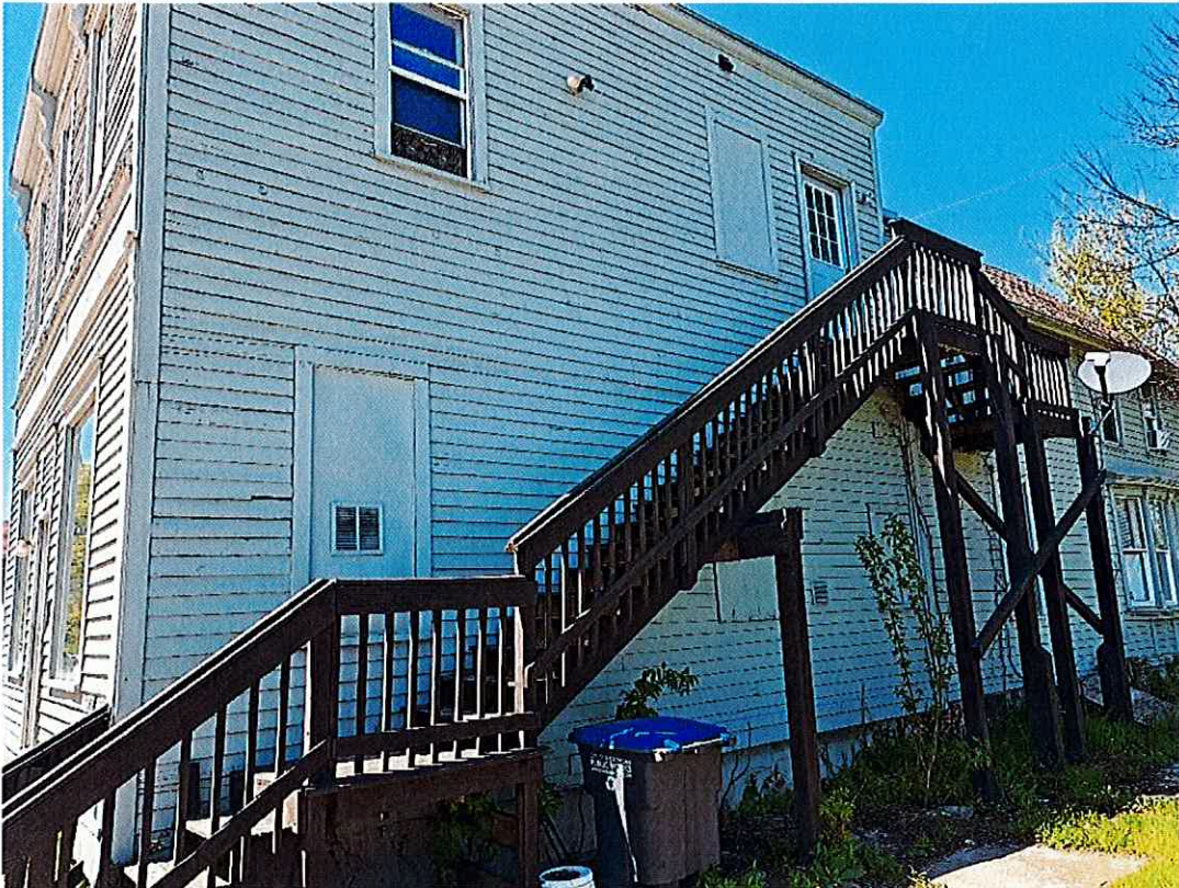
Blue Frog Properties 1136 Indiana Ave • Sheboygan, WI 53081