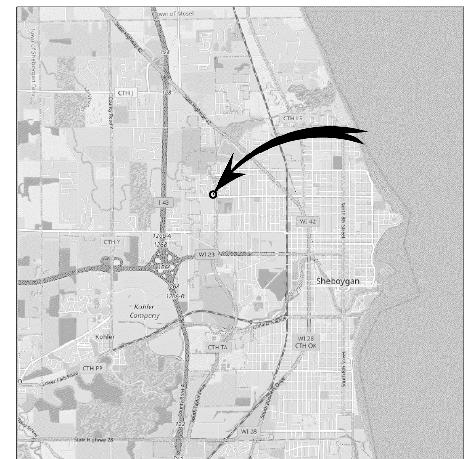
CITY OF SHEBOYGAN