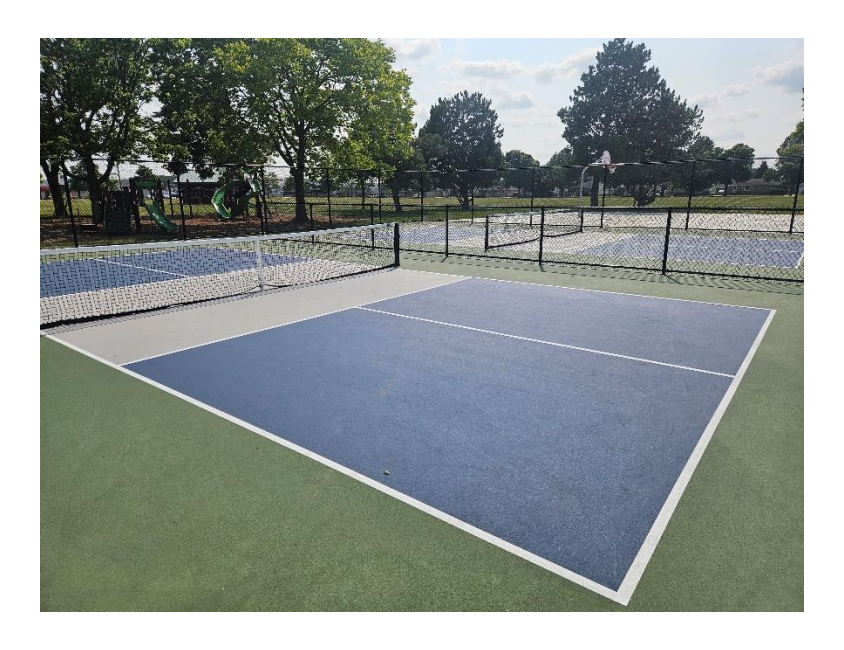
o Kiwanis Park trail to New Jersey Avenue

o Veterans Park, four court pickleball and basketball court