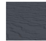
LP TRIM 'MIDNIGHT SHADOW'