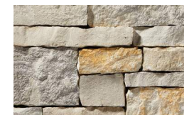
KENSINGTON LIMESTONE FULL BED NATURAL STONE VENEER