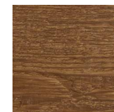
LP LAP SIDING 'AGED AMBER'