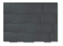
LP SHAKE SIDING 'BONSAI BLACK'