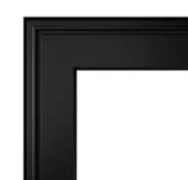
PELLA IMPERVIA WINDOWS 'BLACK'