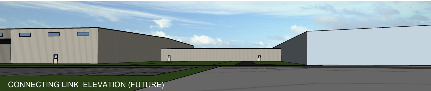
CONNECTING LINK ELEVATION (FUTURE)